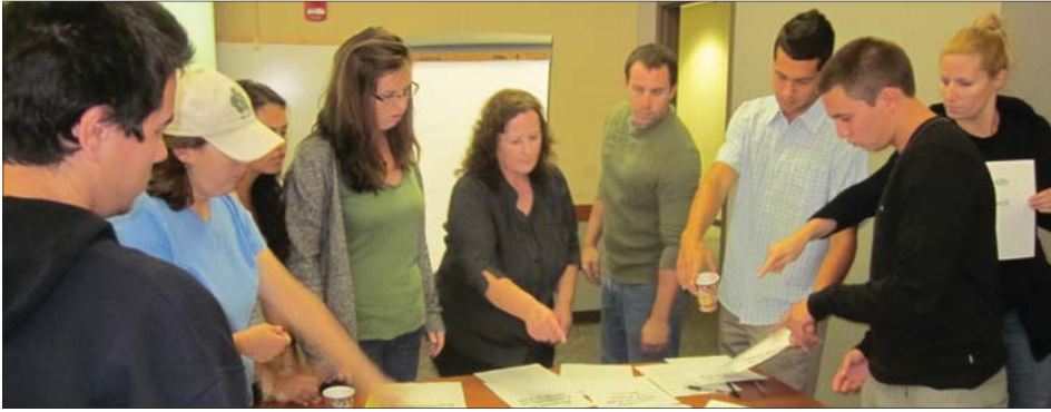
Workshop participants work in teams to organize steps in the CEQA Process.