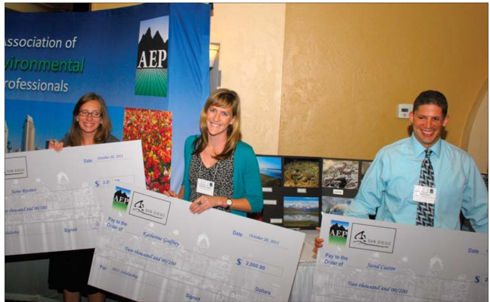
The scholarship winners at the 2011 AEP Awards Ceremony.

It is my intention to be a part of the coevolution of military bases and environmental programs. I wish to help improve the public's perception of the military as environmental stewards and to prepare the military to be a leader in sustainability and conservation, both of which will be necessary to meet the country's resource needs in the future.