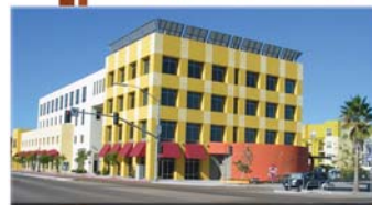
Metro Career Center & Metro Villas