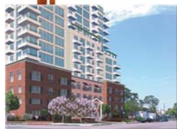
Lafayette Hotel & Residences - Visual Simulation