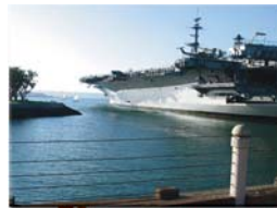
North Embarcadero Visionary Plan EIR